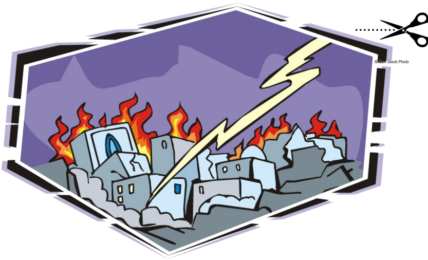
Sodom & Gomorrah